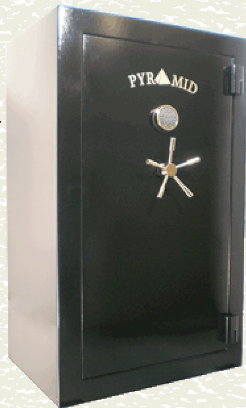
PYRAMID-5940 Gun Safe