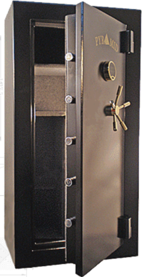
PYRAMID-5930 Gun Safe

Gun safes should not simply be about aesthetics or extravagant bells and whistles. MANCINI Safe Company has produced an attractive product with the security of relockers, cross locks, hard plate and glass. Combined with a strong safe body, thick door slab and solid boltwork, the PYRAMID Gun Safe will protect what's really important to you - your Peace of Mind .